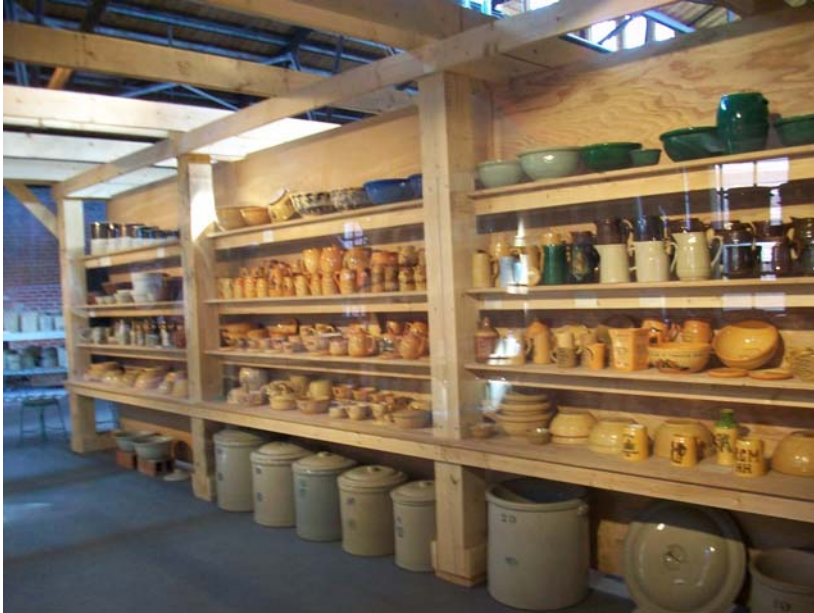
Bottom: The display racks below show only a fraction of the types of pottery created over the years at this site.

**Cypress Hills Vineyard & Winery-- What could be better than finding an oasis in the heart of the prairies? This tour wowed us with scenery and attention to detail. The light lunch of beef rouladen, red cabbage and dessert was a welcome accompaniment to the wine tasting.